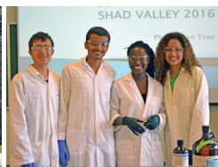
University information www.electronicinfo.ca