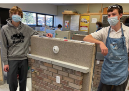
Apprenticeship information www.oyp.com