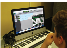
Workplace information www.jobconnectontario.org/newsite/index.html