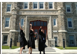
College information www.ontariocolleges.ca